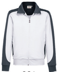
001 white / anthracite

Country of origin Turkey Harmonised code 6110 2091 Product sheet status: 02/2023