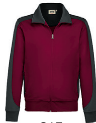
017 burgundy / anthracite