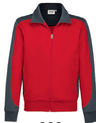
002 red / anthracite