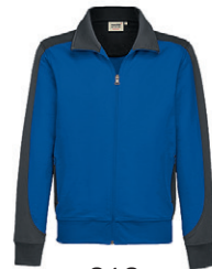
010 royal blue / anthracite