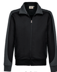
005 black / anthracite