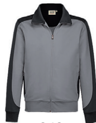
043 titanium / anthracite