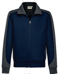
034 ink / anthracite