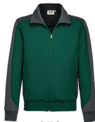
072 fir / anthracite