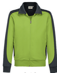
040 kiwi / anthracite