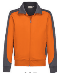
027 orange / anthracite